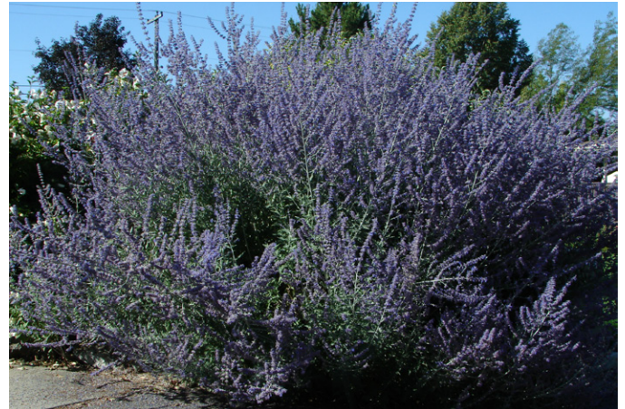
Fig. 9. Russian sage ( Perovskia atriplicifolia ) blooms for months, and is the authors' favorite pollinator plant. 1