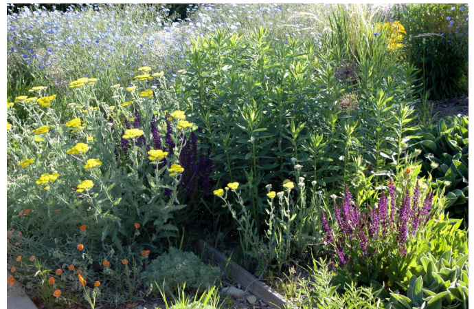
Fig. 11. Design the pollinator garden with a succession of blooms for season-long foraging. 1