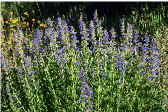
Fig. 10. Blue hyssop ( Hyssopus : Lamiaceae) blooms in mid to late summer and is very hardy. 1