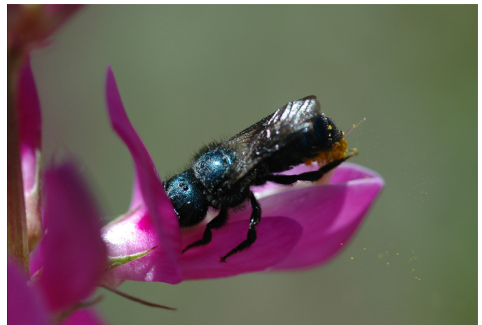
Fig. 4. Mason bees ( Osmia ) are very important pollinators, and are superior to honey bees in tree fruit orchards. They forage at hundreds of different flowers, including sweetvetch ( Hedysarum Fabaceae ). 1