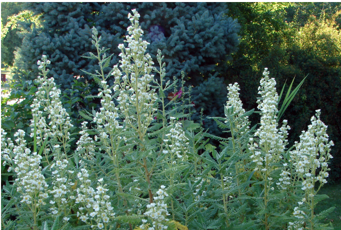
Fig. 8. Fernbush ( Chamaebatiaria millefolium ) is a native shrub with aromatic foliage. 1