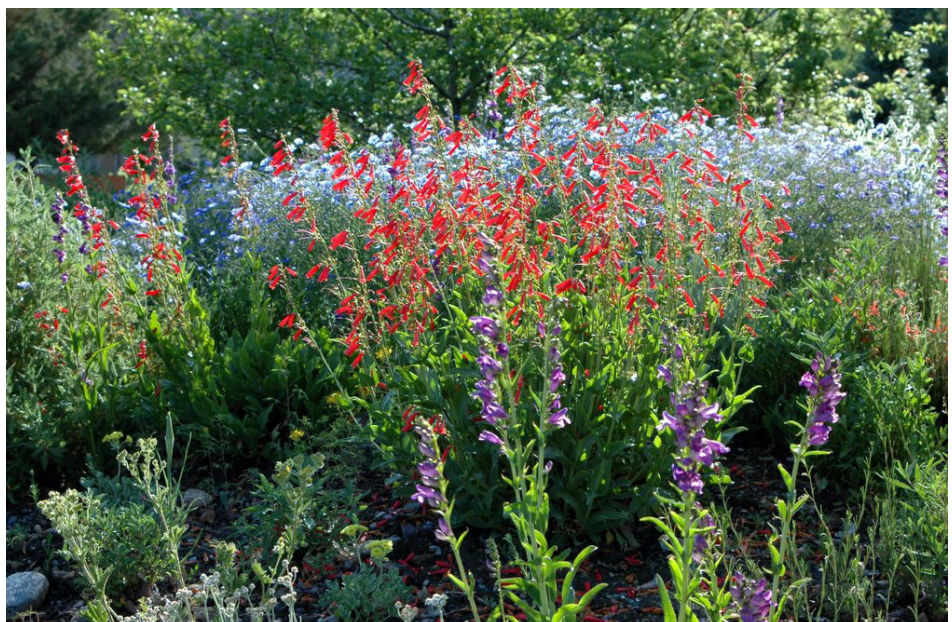
Fig. 2. A pollinator garden can also be water-wise. Purple Penstemon strictus , front, firecracker penstemon ( P. eatonii ), center, and blue flax ( Linum perenne ), background, combine to make a pleasing design. 1