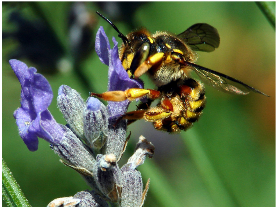
Fig. 1. Carder bee ( Anthidium ) foraging at lavender ( Lavendula : Lamiaceae). 1

Our flower gardens can become valuable cafeterias for local populations of diverse native bees. In our cities and towns, native plant communities have been displaced by pavement, buildings and lawns. In the countryside, grain and hay crops likewise