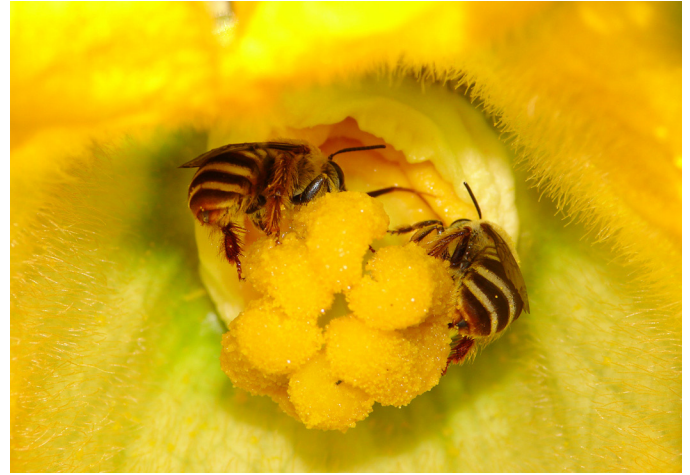
Fig. 7. The native squash bee ( Peponapis pruinosa ) pollinates most of Utah's squashes and pumpkins (cucurbits), and is active primarily in the early morning hours. 1