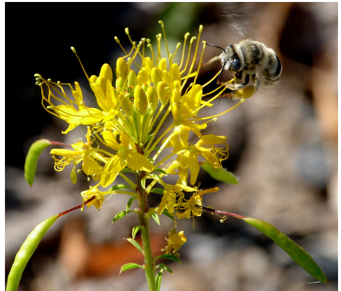
Fig. 3. Nevada bee-plant ( Cleome lutea ) is a water-wise annual native to western U.S., providing pollen in summer to bees such as this Anthophora digger bee. 1

wiki.bugwood.org/Invasipedia , lists close to 200 species with detailed information on each