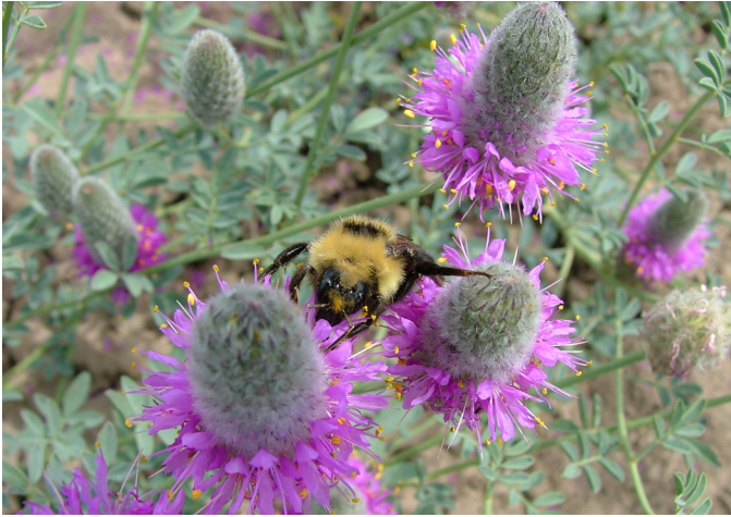
Fig. 6. The legume, western prairie clover ( Dalea ornata ), is an Intermountain West native, producing pollen for months for bees like this bumblebee ( Bombus ). 2

The list is a work in progress. If you find errors, oversights or useful refinements, I will be happy to consider your suggestions for modification so long as it retains its current form. You may disseminate the list or modify your copy of it for local needs or your personal preferences as you see fit. Happy bee-ing!!